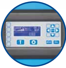
ADVANCED INTUITIVE CONTROL