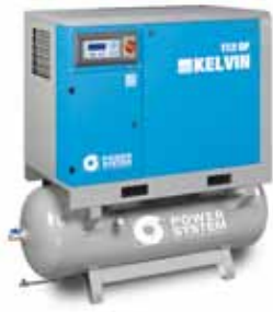
▲ KELVIN 11-10-270 DF