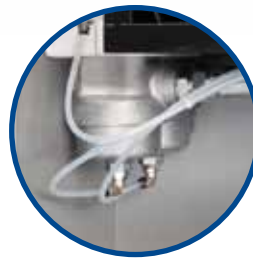
ON BOARD DUAL COMPRESSED AIR FILTRATION