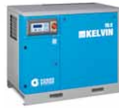
▲ KELVIN 15-10