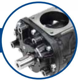
PREMIUM QUALITY COMPRESSOR AIR END