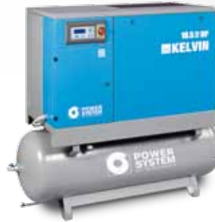
▲ KELVIN 18.5-10-500 DF