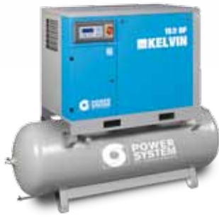
▲ KELVIN 15-10-500 DF