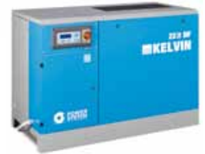
▲ KELVIN 22-10 DF

The KELVIN range is available in different versions, to satisfy every installation requirement: