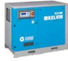
▲ KELVIN 11-10 DV